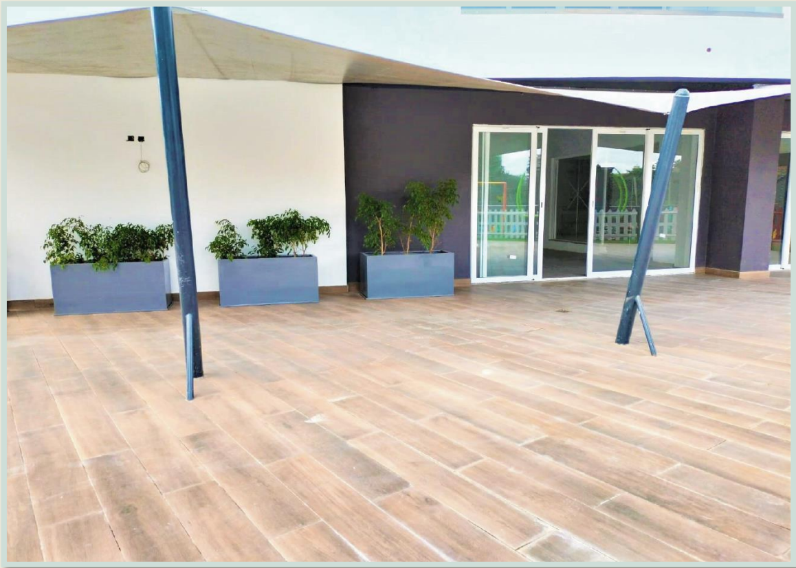
Fig 11. Coffee shop area (Operator Executing Plans)