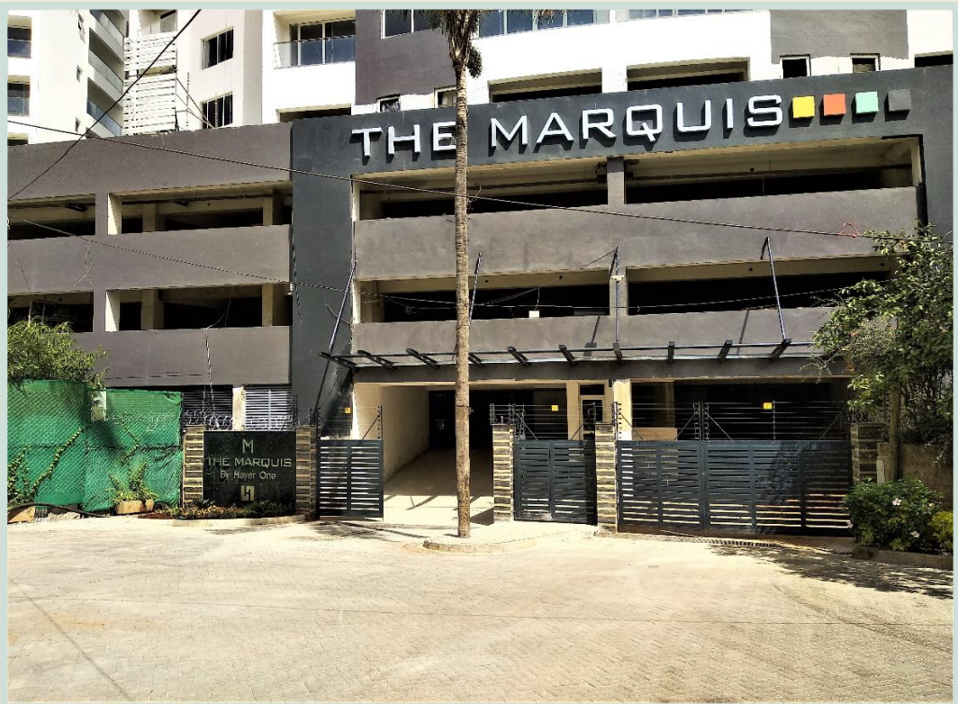
Fig 22. Signage installations