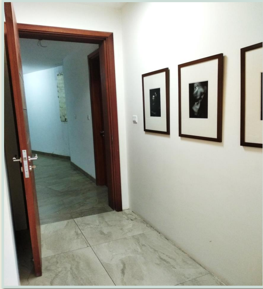
Fig 19. Hallway tilework - 1st Grade full bodied porcelain & rectified Spanish made tiles