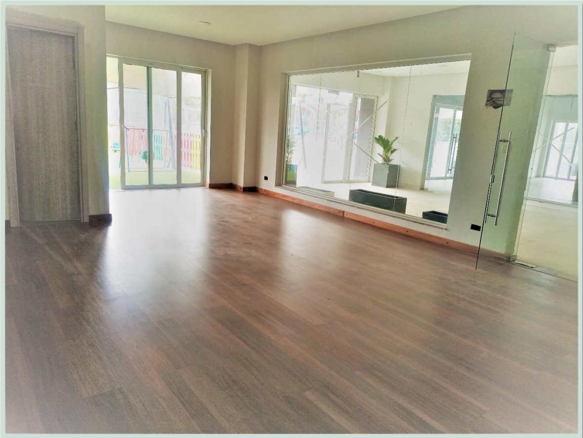
Fig 13. Daycare Centre area