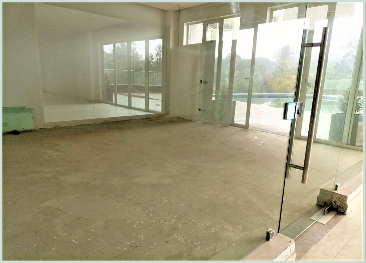
Fig 17. Convenience store area (Operator executing plans)