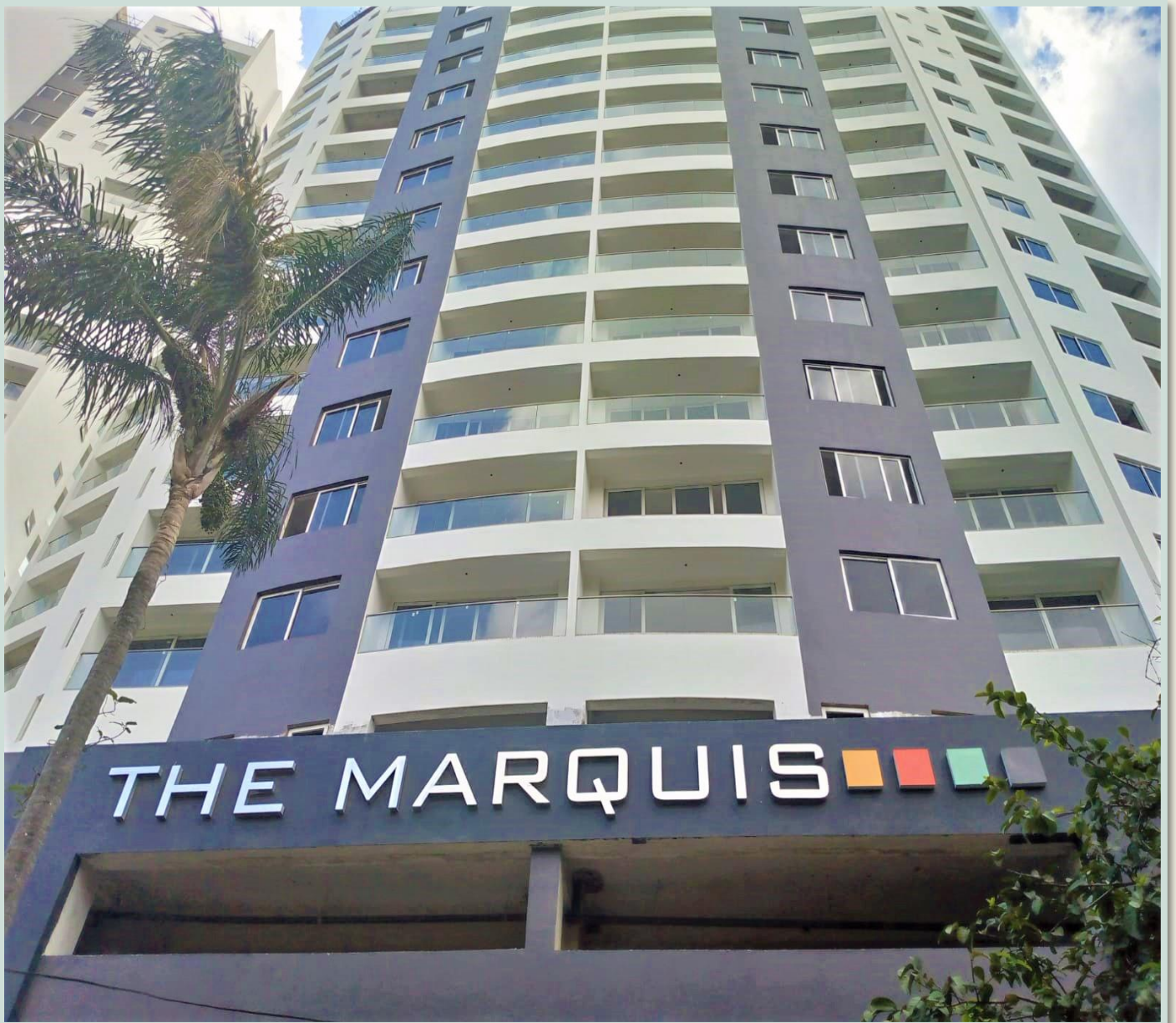
Fig 2. The Marquis - Ground level view