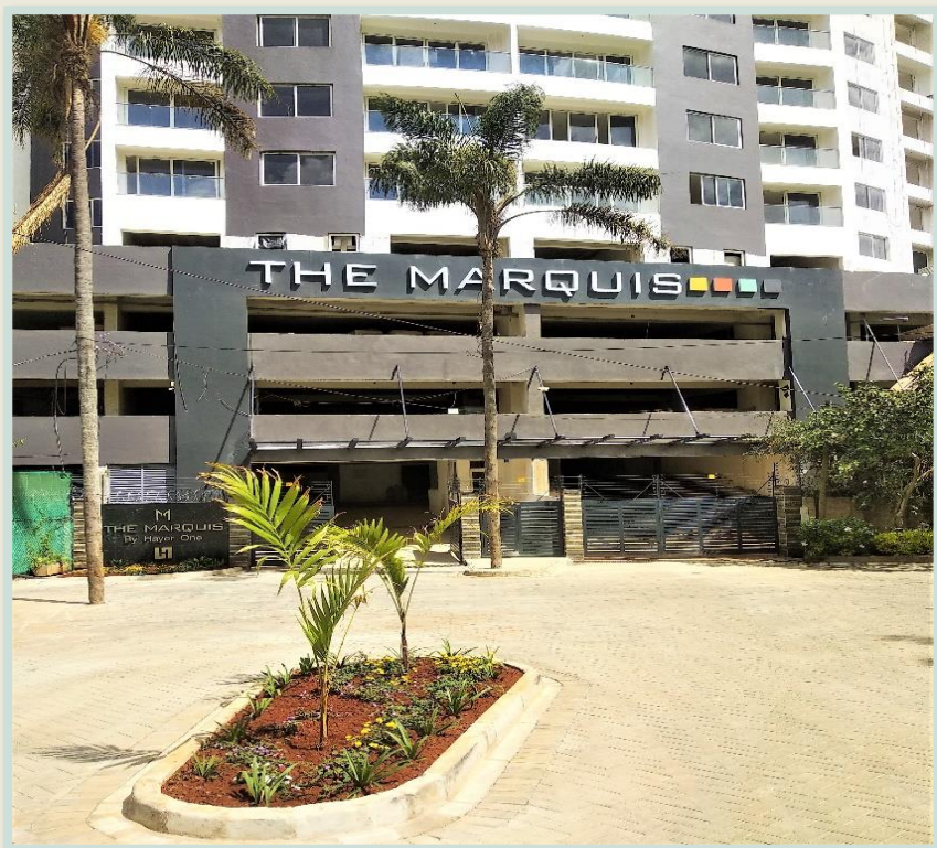
Fig 20. Cabros installed from main entrance till the road