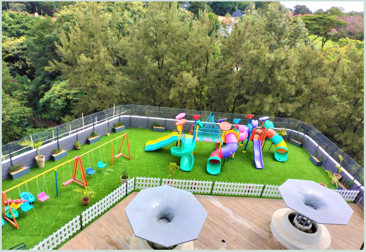
Fig 8. Children play area