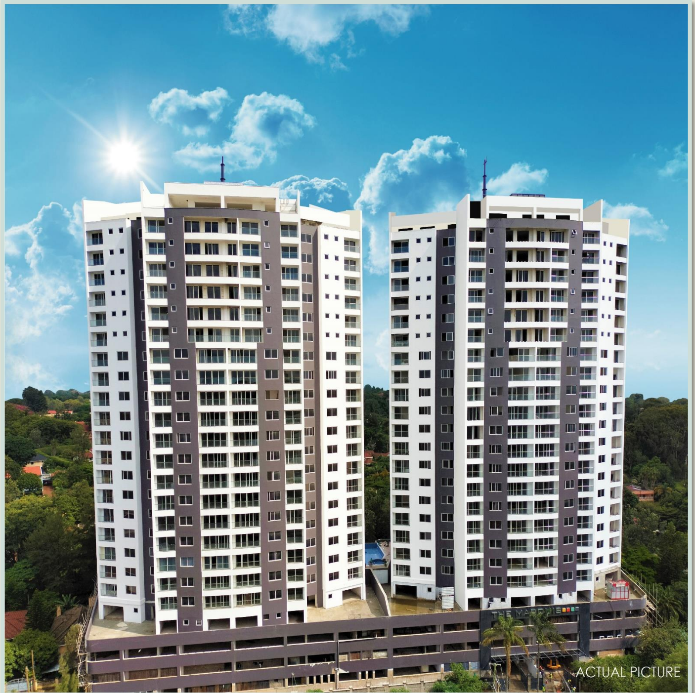
Fig 1. Block A & Block B aerial view - Complete structure

‘The Marquis’ - BLOCK A & BLOCK B - 100% Complete Structure