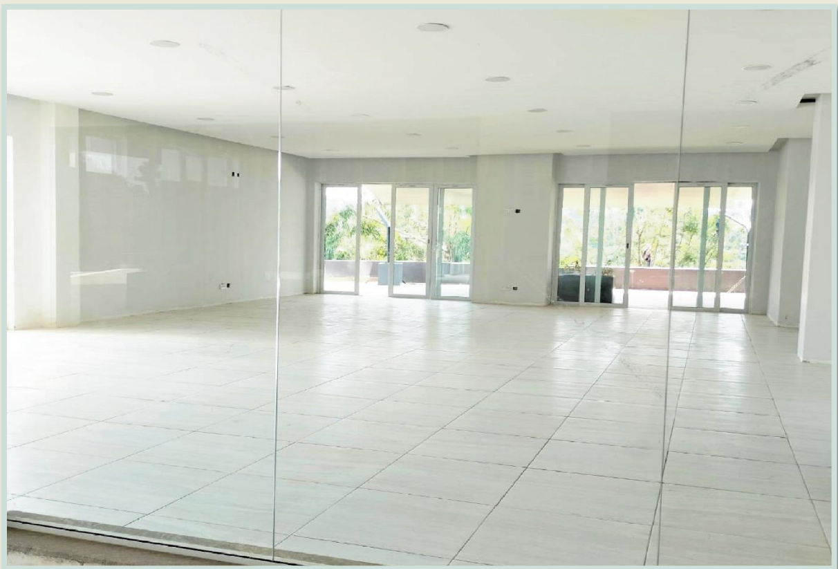
Fig 16. Social hall area