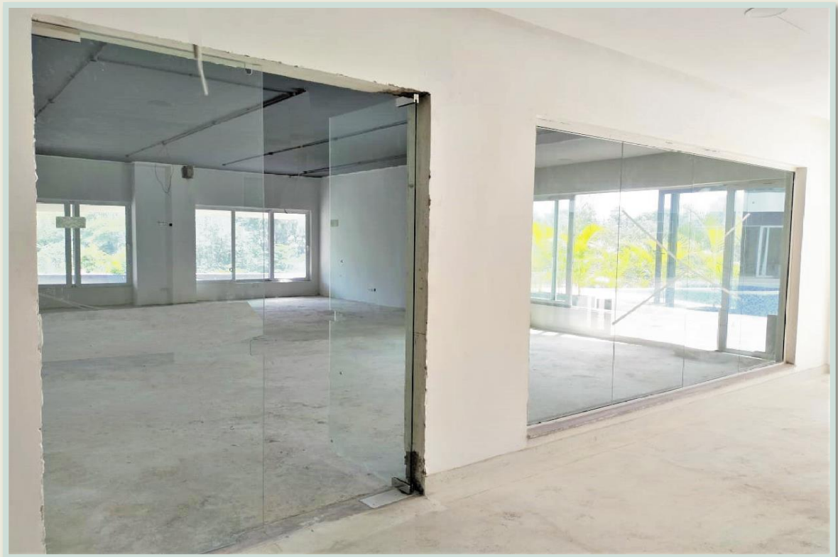
Fig 14. Gym area (Equipments procurement ongoing)