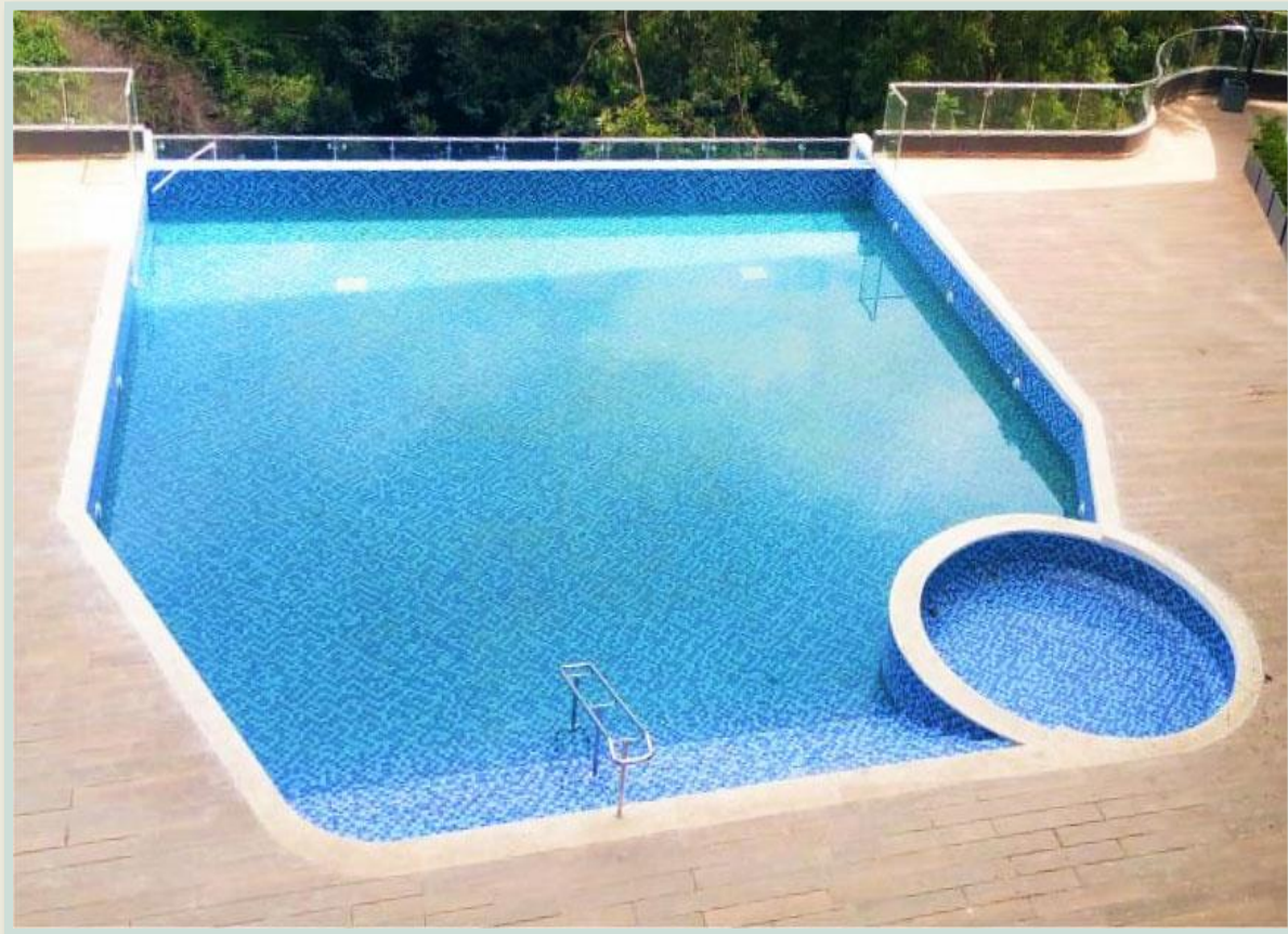
Fig 6. Heated infinity pool with children pool – 250SqM