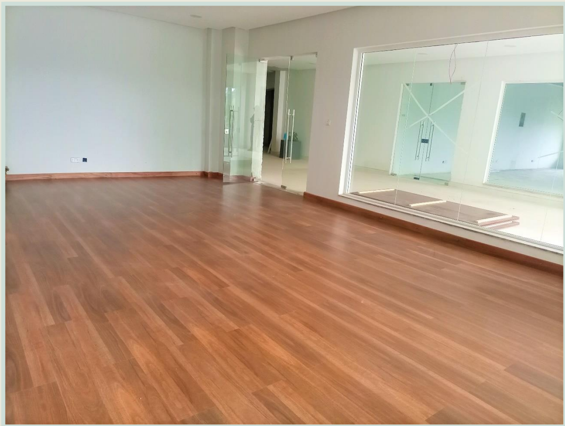
Fig 12. Yoga room area