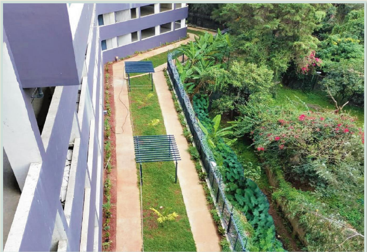
Fig 18. Jogging track area