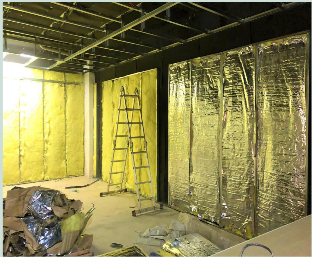
Fig 10. Private State Of the Art Mini Theater under construction.