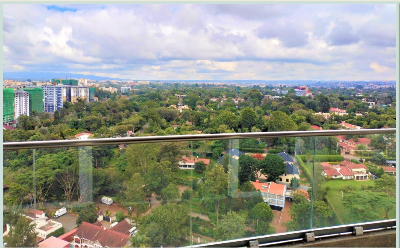
Fig 24. Leafy Lavington greenery view