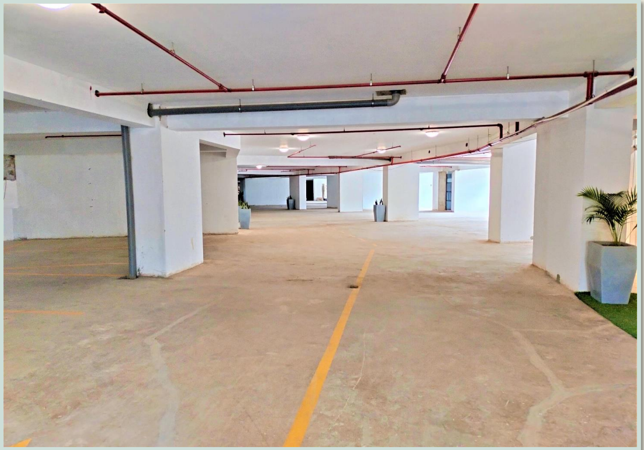
Fig 23. Spacious and well lit parking spaces