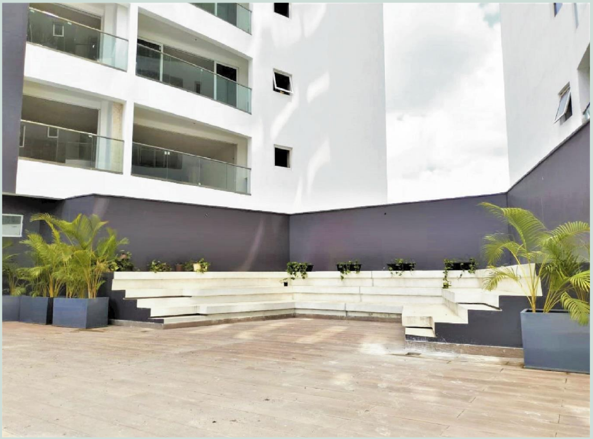
Fig 9. Amphitheatre – Open to sky