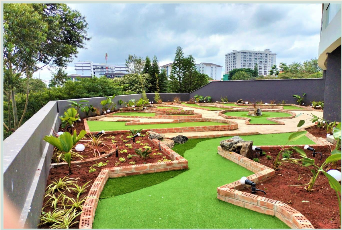
Fig 7. 7 Hole putting green (Mini-golf area)