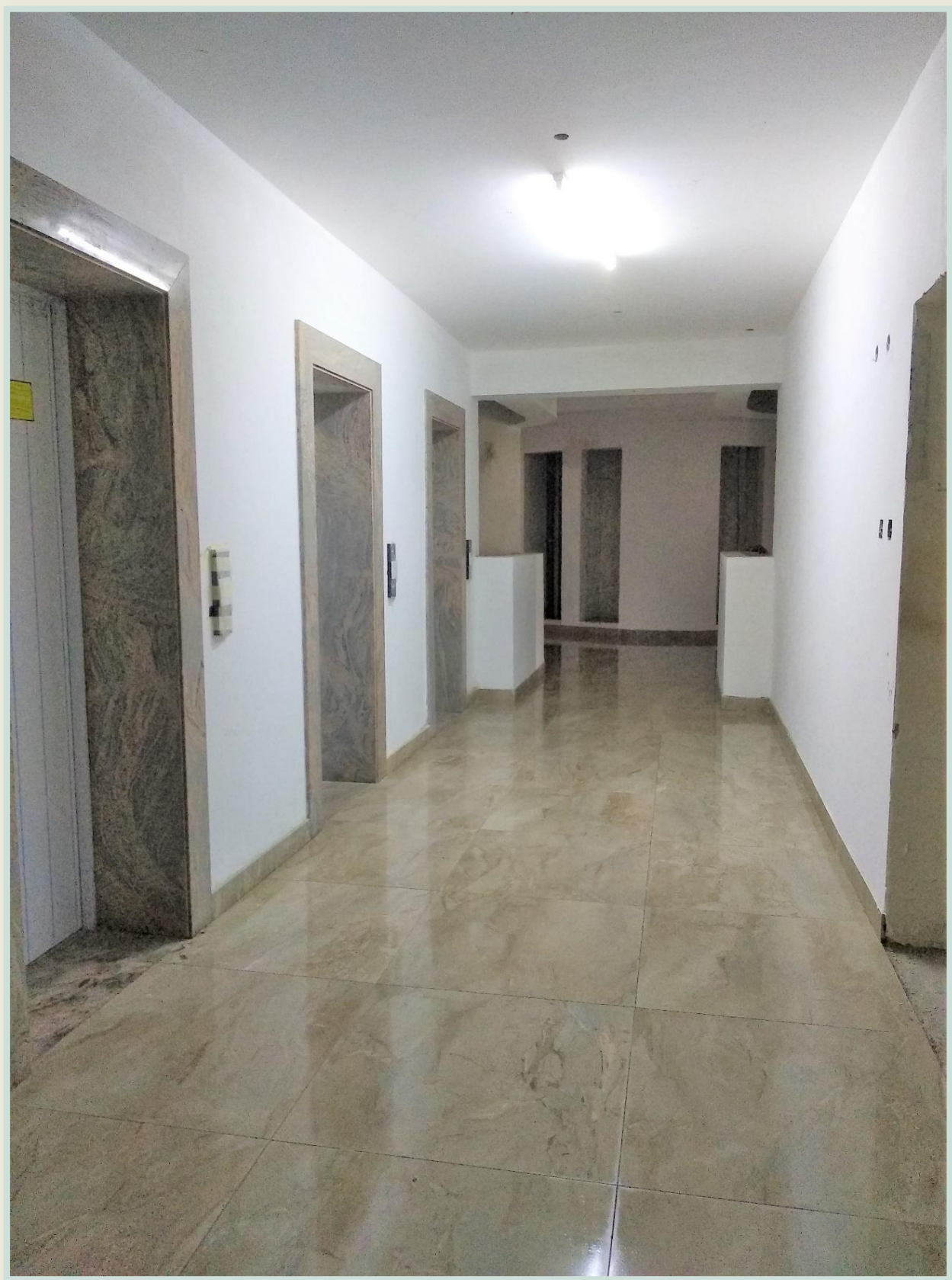
Fig 21. Lift lobby with modern cabin and elegant design