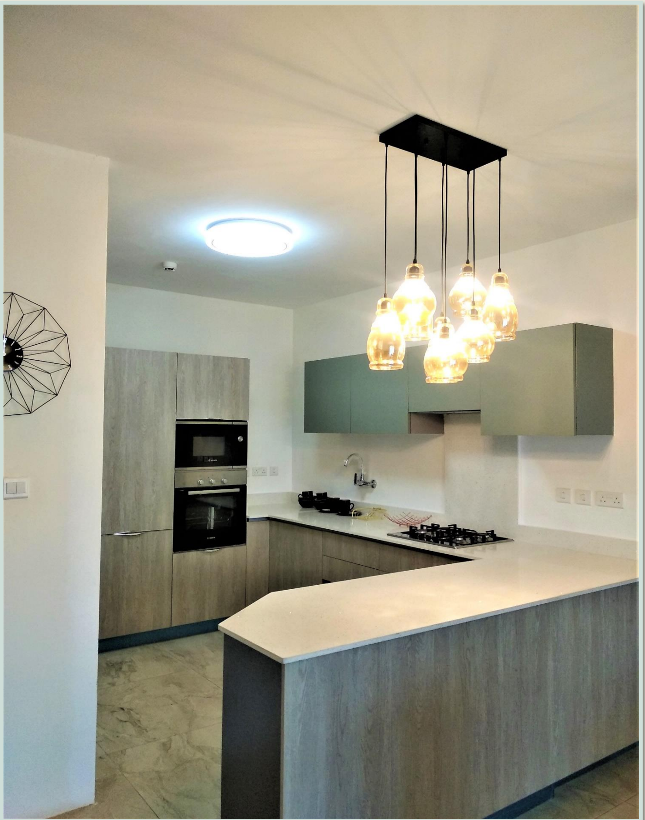
Fig 4. Kitchen cabinetry