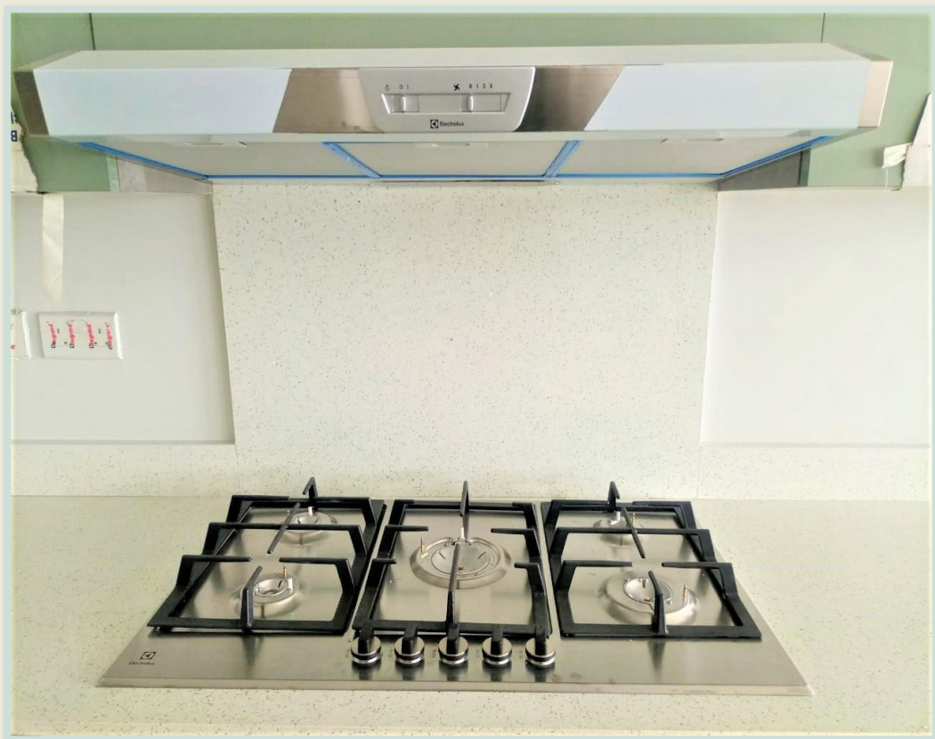
Fig 5. Kitchen appliances (Microwave, Oven, Cooker and Hob Extractor)